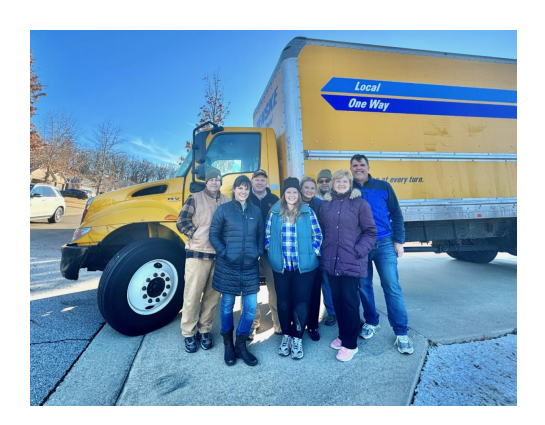
My Amazing Family! Weather Didn't Stop Them!